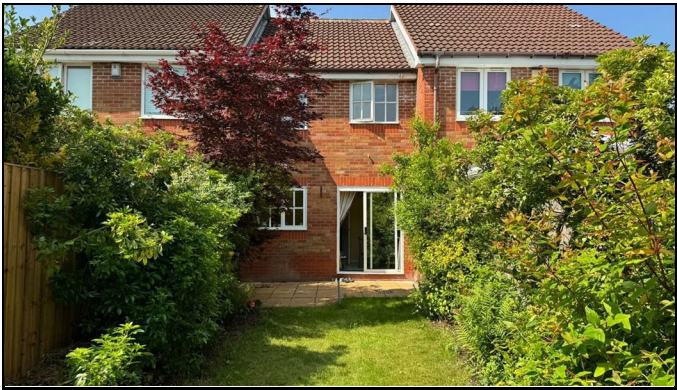
Bilberry Crescent, Sutton Coldfield, B76 1SL